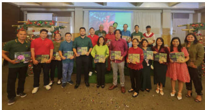
Contributors of the 2023 Mobile Photography Adventure were rewarded with the first edition of Nature in Carmelray Book.